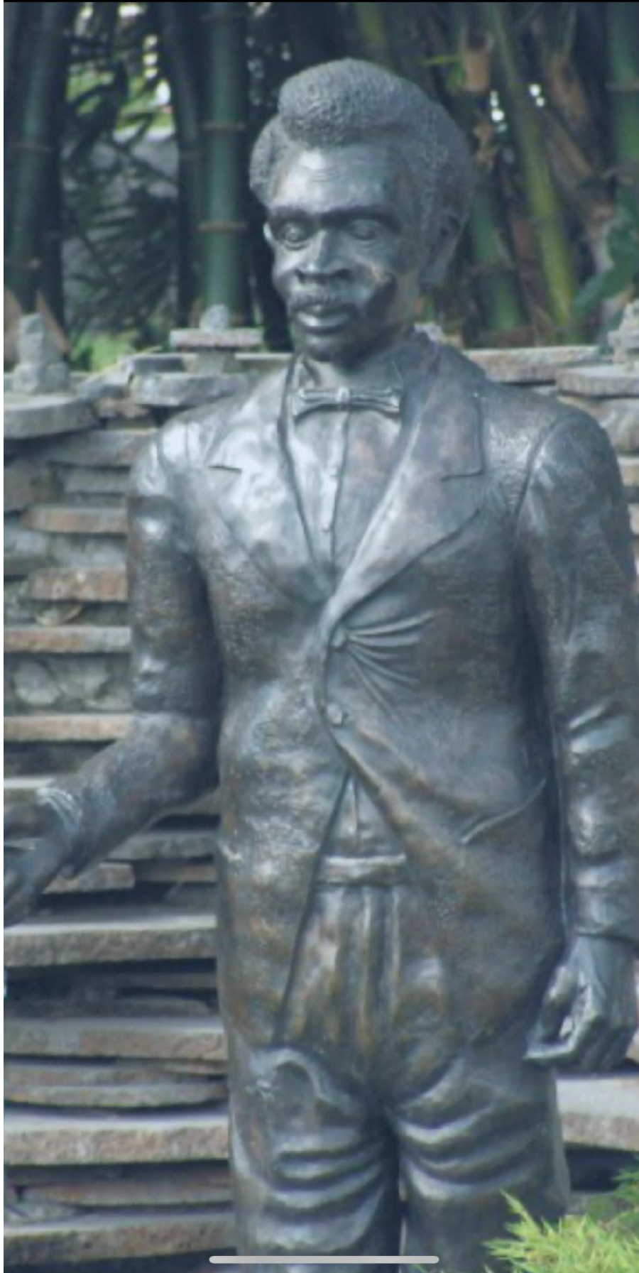
Caption: Edmond Albius's statue in Sainte-Suzanne, Réunion, a tribute to the boy who saved vanilla.